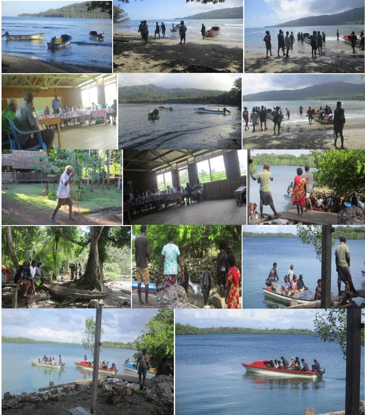
Photos 2: Zaira community left Oloana Bay in three boats and travelled to Seghe to attend the timber rights hearing over Sugili & Tavoamai Lands. A total of 40 people {men, women, boys & girls} were transported to Seghe on Wed 6 th Sept 2023. The public hearing was held on Thur 7 th Sept, 2023. The Western Provincial Government organized the hearing. All expenses to attend