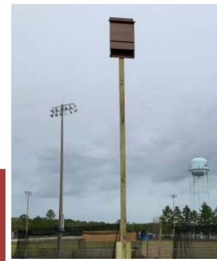
3 chamber at Bronson Elementary