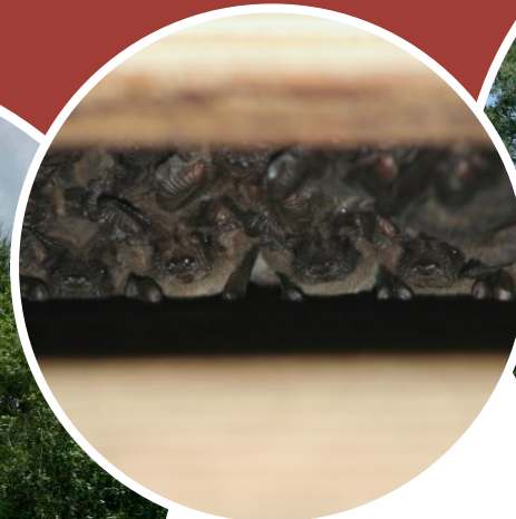
Mexican Free- tailed Bats in a Lubee bat house