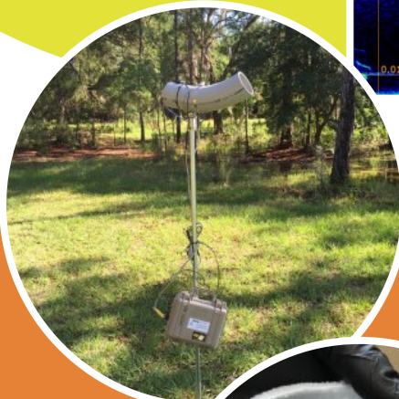
Acoustic monitoring equipment