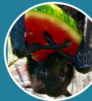
Malayan Flying Fox LOVE watermelon