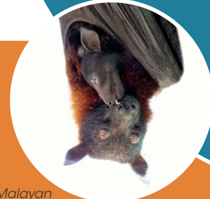
Malayan Flying Fox mom and pup