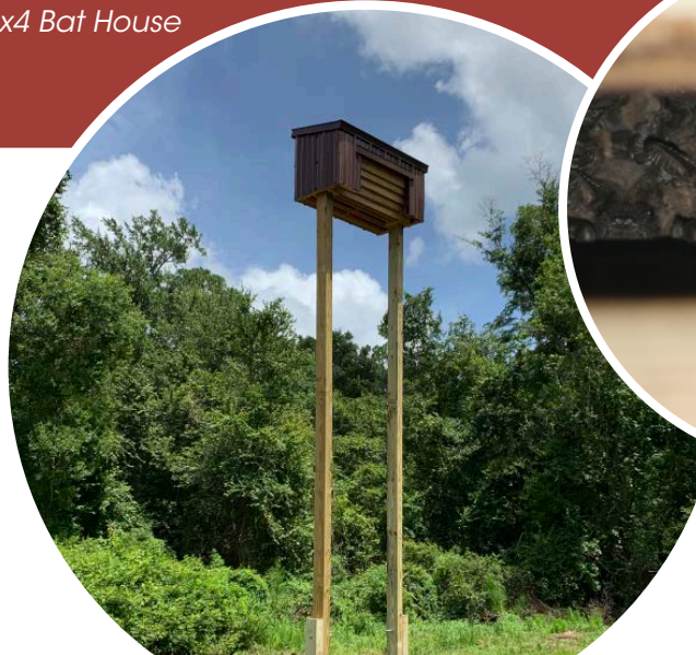
2x4 Bat House