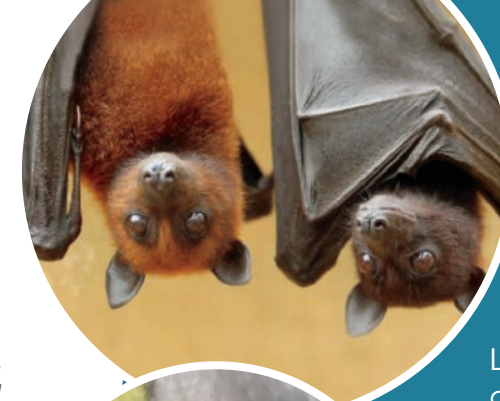
Twin Variable Flying Fox

Bats are the primary predator of night-flying insects, including mosquitoes and agricultural pests. One bat can eat hundreds of insects a night! Putting a bat house on your property is a win/win - you provide the home, they'll take care of the bugs.