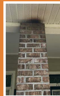
Bats living in brick column