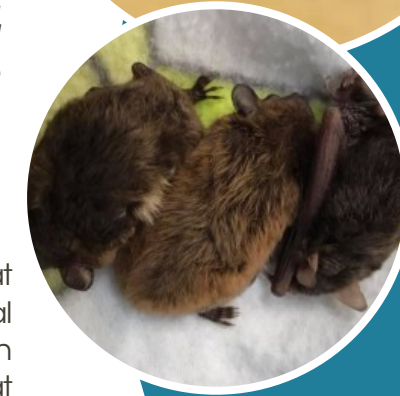
Native Evening & Southeastern Bats