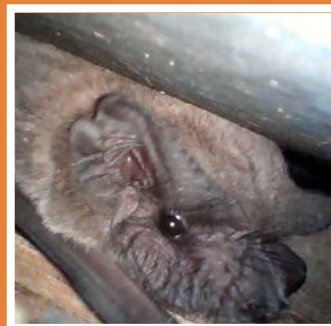
Mexican Free-tailed bat in building.

Lubee staff provides advice on humane bat exclusion for residential and commercial properties. Our trained biologists can recommend professional companies that provide exceptional service and the utmost care to ensure all bats are removed safely and humanely. Please note that exclusions CANNOT legally occur April 15 - Aug 15 in Florida due to maternity season.