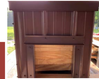
2x2 Bat House