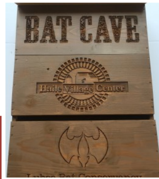
4 chamber for Haile Plantation

Lubee staff members have installed numerous bat houses throughout the southeast and are happy to do the work for you!