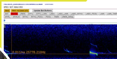
Mexican Free-tailed Bat echolocation calls

Do you have bats on your property that will utilize houses? Lubee staff members are trained in acoustic monitoring and call analysis. Let our knowledgeable staff set up monitoring equipment to determine what species are common in your area. Lubee staff have analyzed thousands of calls and are eager to continue this amazing glimpse into the secret lives of bats.